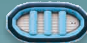
SILVER CLOUD 435