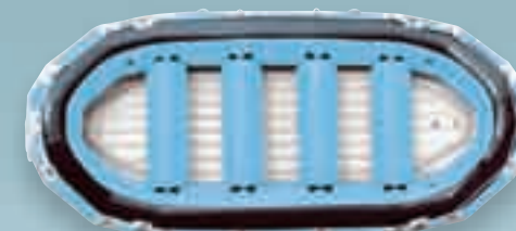
SILVER CLOUD 490