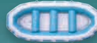
SILVER CLOUD 410