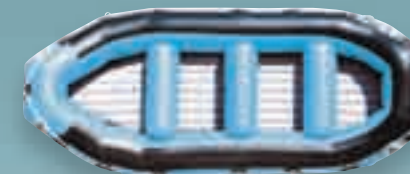
SILVER CLOUD 465